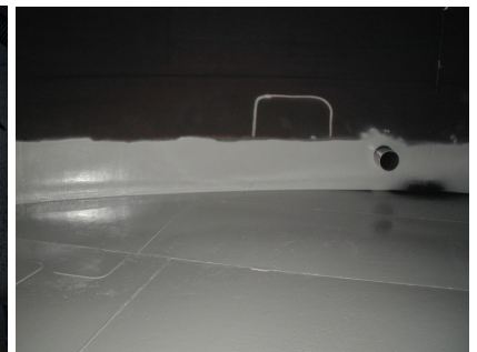
Humidur layer SPC021