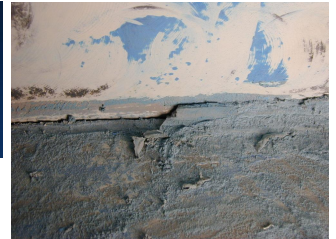
Old sealing between floor and wall

After gritblasting, degreasing, dedusting and stripe-coating of the tank floor and wall, a final coat of minimum 400µm was applied as a com- plete corrosion protection of the interior tank.