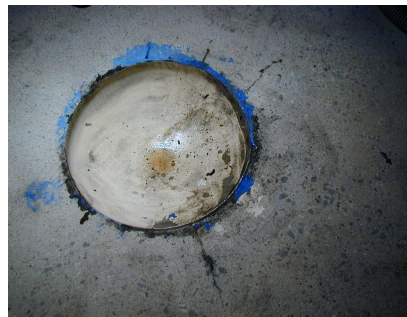
Damaged center of Tank T12