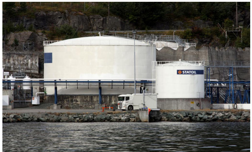
Statoil Fagervika depot in Trondheim , Norway